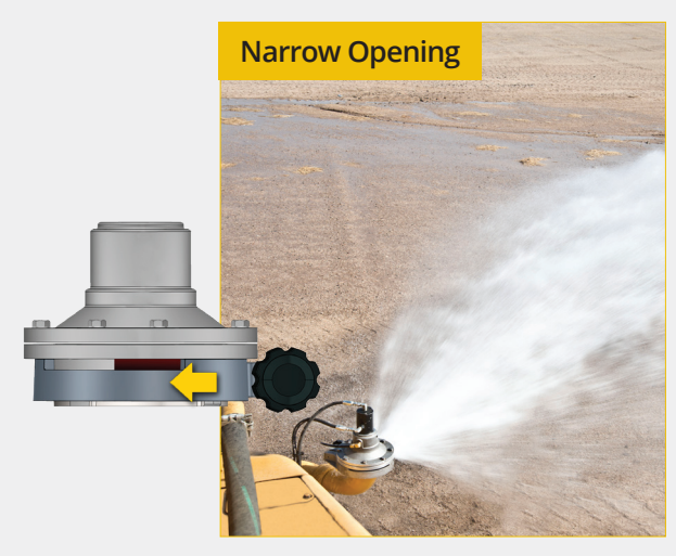
A Mega spray head adjusted to a narrower opening width sprays a more focused stream of water that travels further.