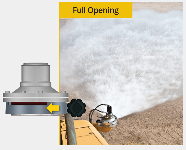
A Mega spray head in the default full (90°) opening setting emits a wide, even fan of fine spray.

Mega spray heads can be rotated on their base plate mounts to adjust the horizontal direction of the discharge spray for each individual spray head, allowing the spray heads to be 'aimed' for optimal spray coverage. An adjusting ring allows for further customization by providing control over the width of the spray fan. The adjusting ring can be rotated to widen or narrow the spray between a 90° and a 10° fan opening.